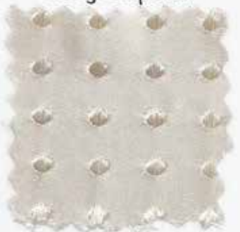
Ivory Polka Dot (w)