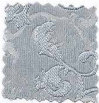
Silver Damask (w)