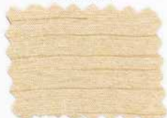
Pale Gold (c)