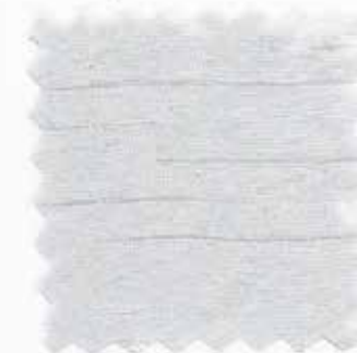
Silver (w, c)