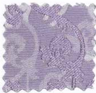
Lilac Damask (w)