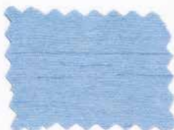
Sky Blue (c, t)