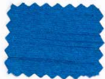
Royal Blue (c)