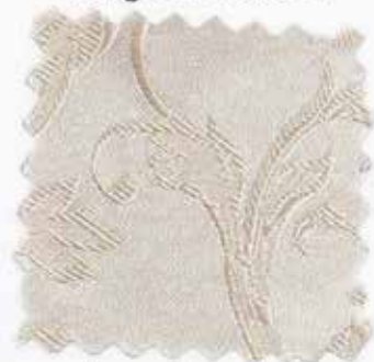
Ivory Fleur (w)