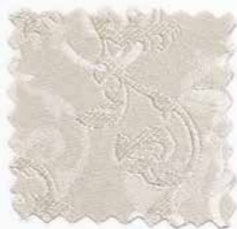
Ivory Damask (w)