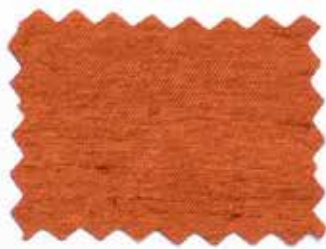
Burnt Orange (c)