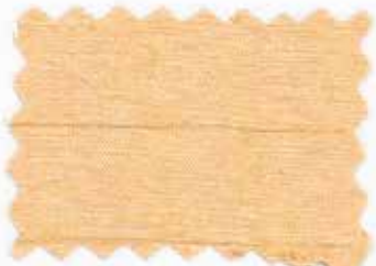
Gold (c, t)