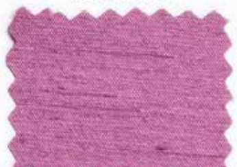
Dusky Pink (c)