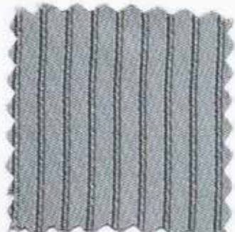
Silver Stripe (w)