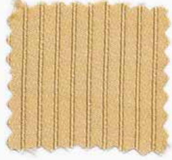
Antique Gold Stripe (w)