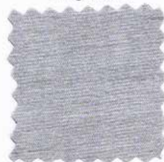
Antique Silver (w, c, t)