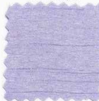
Lilac (w, c)