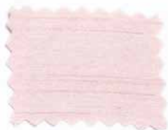
Pink (c, t)