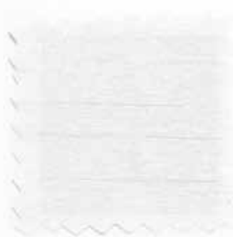
Ivory (w, c, t)