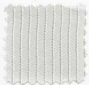
Ivory Stripe (w)