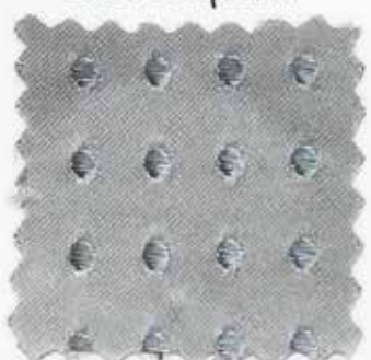
Silver Polka Dot (w)