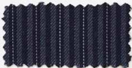
Navy Stripe Trouser