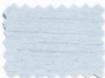
Ice Blue (c)