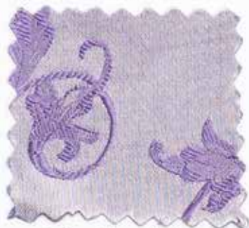
Lilac Fleur (w)