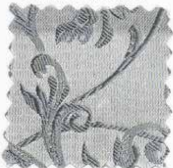
Silver Fleur (w)