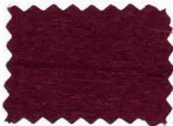
Dark Wine (c)