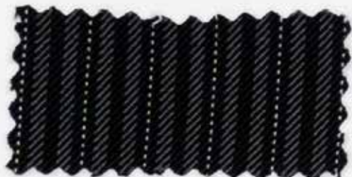
Grey Stripe Trouser 55% poly / 45% wool